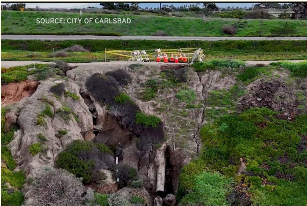
Failing bluffs near Terramar Beach entrance

The City of Carlsbad has recently declared an emergency in the ocean bluffs area near Terramar Beach. This is located on Carlsbad Boulevard (PCH) and Solamar Drive. The erosion surrounds an old large storm drain pipe. There is a large hole at the top of the bluffs. The City has limited the access to walkers in this area and has ordered emergency repairs. The situation is complicated by the limits imposed by the Coastal Commission, which only allows the use of "hard" materials like boulders and concrete to be used in extreme conditions, and after all other options have been evaluated or tried.