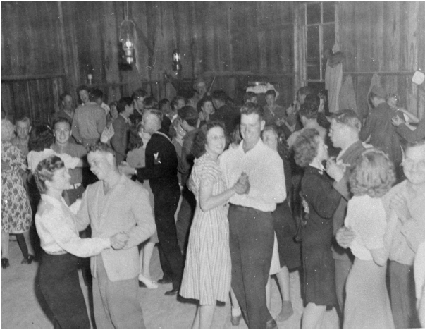
Dance at the Olivenhain Meeting Hall