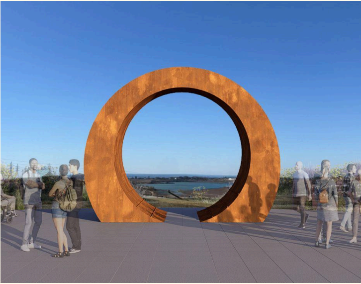
Proposed Monument for Veterans Memorial Park

https://www.carlsbadca.gov/departments/parks-recreation/parks-community-centers/parks/future-park-planning/veterans-memorial-park